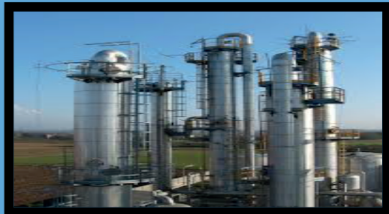
TOWER / COLUMN